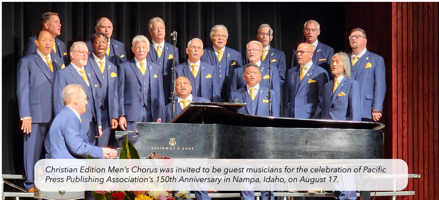
Christian Edition Men's Chorus was invited to be guest musicians for the celebration of Pacific Press Publishing Association's 150th Anniversary in Nampa, Idaho, on August 17.